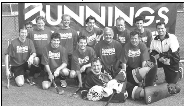
Winners of The Titans Match – Coach's XI