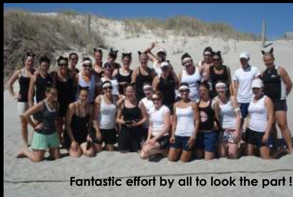
Fantastic effort by all to look the part !

buried cone on beach is not easy); Blind lead the blind through an obstacle course;